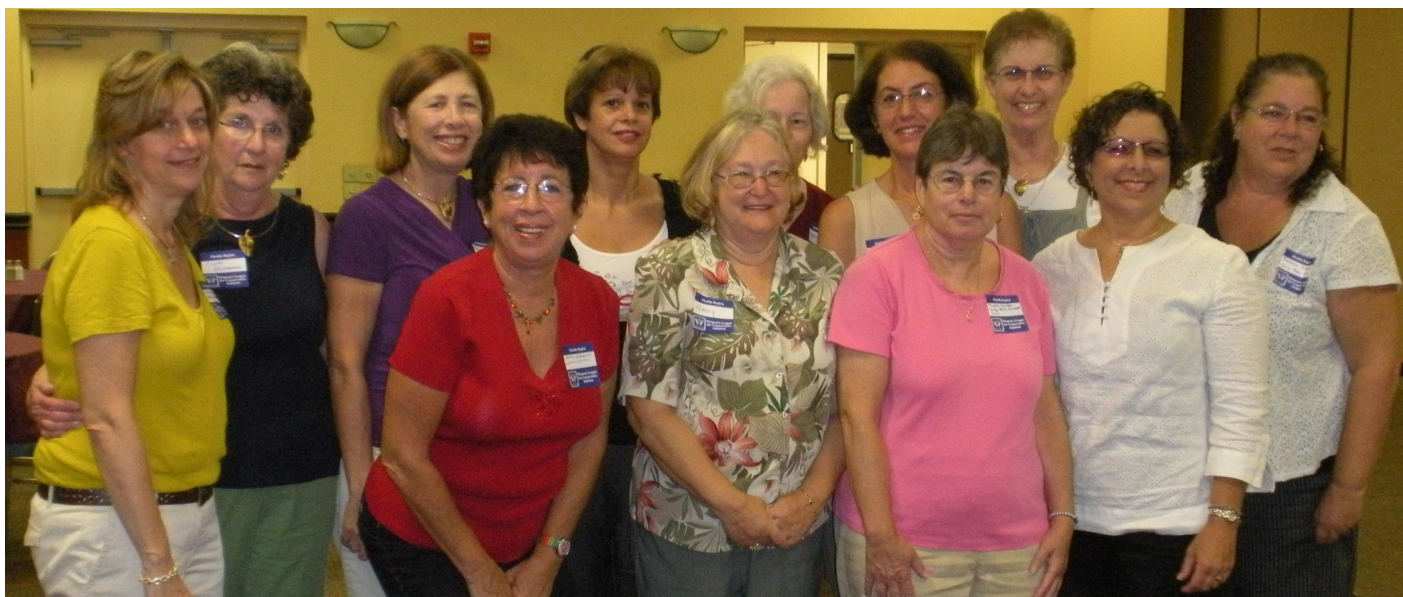
Representatives from Congregation Beth Shalom

Sisterhood Cluster Meeting in Tampa on Sunday, August 1st 2010