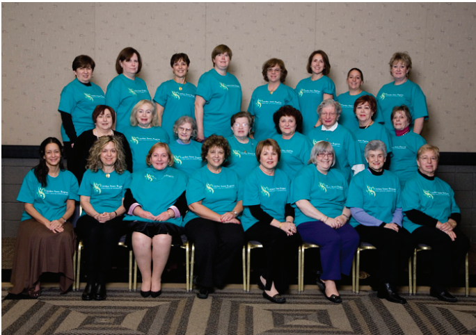
2008 GSR Convention Delegates.

Pictures from convention are available to order. For more information, contact Meryl Balaban.