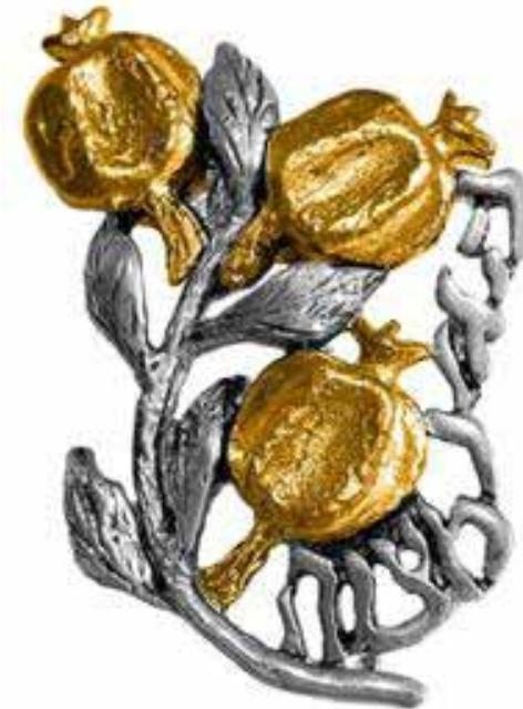
Benefactor's Pin 2011-2012 Hiddur Mitzvah

Our Annual Torah Fund Event this year will be held in March, 2012. We have already begun making plans for it and it promises to be very exciting! We will be bringing Torah Fund into the 21st century! Watch for more information in upcoming weekly notices and in the next Mid-Atlantic Happenings.