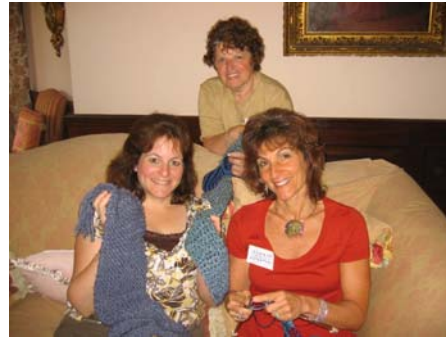
Beth Hillel Beth El sisterhood (Wynnewood, PA ) knitting group

Our Sisterhoods devote energy, hours, funding and sometimes even tears to making our synagogues and the greater communities better places to live. Why we do this is because as Jewish women, it is our responsibility to perform acts of chesed and Tzedakah. We know that the Sisterhoods of the MID-ATLANTIC REGION are doing amazing things to make our world a better place to live. We want to hear from you so we can share your ideas on the region's web and bulletin pages; pictures, as well as ideas are invited. Currently many of our sisterhoods are knitting, gloves, hats, scarves sweaters, baby blankets etc. for the people of DETROIT. These beautiful handcrafted items will be the centerpieces at convention dining tables this year and then distributed at the end of convention. WOMEN'S LEAGUE really has a HEART AND A SOUL. Once again LAUREL HOUSE, www.laurel-house.org , a women's and children's domestic violence shelter in Montgomery County, PA has given us a wish list of items they need to enhance the quality of life of their temporary residents.