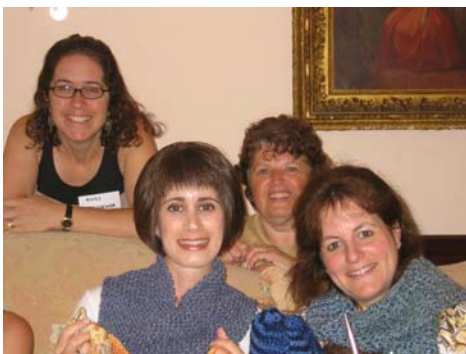
Beth Hillel Beth El sisterhood (Wynnewood, PA ) knitting group

I look forward to hearing from your sisterhoods with what you are doing to make a world a better place: book drives, blood drives, planting trees in Israel, volunteering in the Nursery School, literacy programs, supporting USY, Meals on Wheels and so forth. Together as Sisterhood women we can change our world for the better.