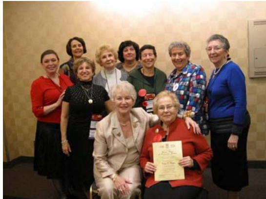
Mid-Atlantic Region WLCJ culmination of past presidents from the former EPA, SNJ, and Philadelphia Regions of WLCJ.